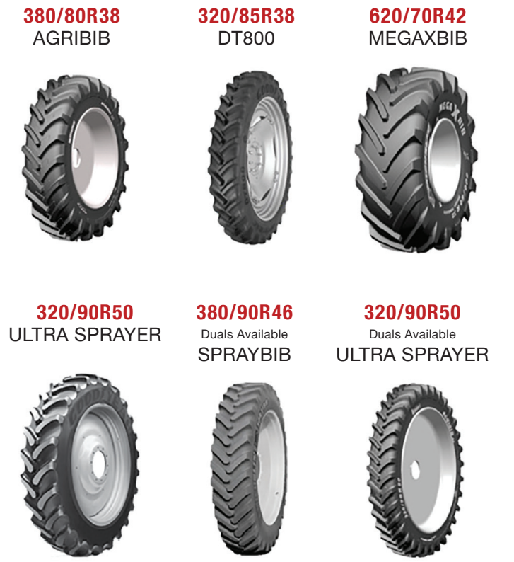
Several tire options listed are available only as aftermarket purchases, not factory installed.

Michelin® Spraybib Tires come standard on all AS Series and HS Series models. Every tire used by Apache is inspected upon assembly to ensure that farmers enjoy a long service life. All Michelin Spraybib Tires feature exceptional load capacity, unmatched driver comfort and are rated for speeds up to 40 mph. The longer footprint allows for reduced soil rutting and optimized yields, while the reinforced tread design stretches the service life and increases stubble resistance.