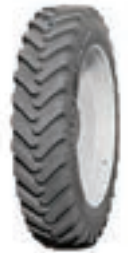
380/90R46 Duals Available SPRAYBIB