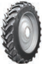
320/90R50 ULTRA SPRAYER